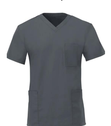
Advanced Nurse Practitioner Grey