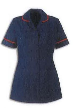
Matron Navy Blue Red Trim