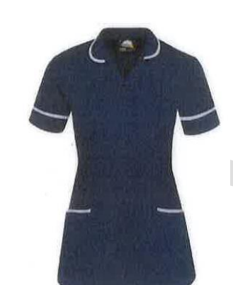
Junior Sister / Senior Nurse Navy Blue, White Trim